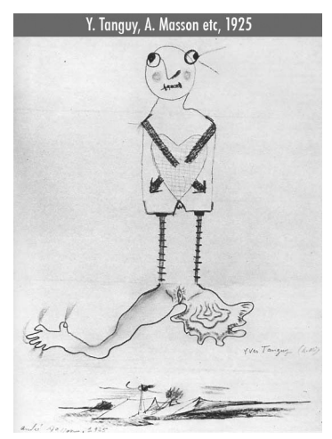
Exquisite Corpse Drawing (1925), courtesy of John Rendell, www.exquisitecorpse.com

compelling metaphor. For example, I might show the drawing below and ask the students what they think the eyes look like. If they say "baby birds," I would then ask them for a more detailed and active description. What are the baby birds doing? Where are they? What happened to them? We might start the poem, "My eyes are baby birds/ who lost their mothers decades ago." Or a student might think the legs look like an